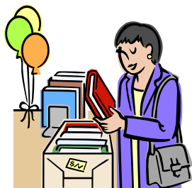
Book Fair 15th-18th